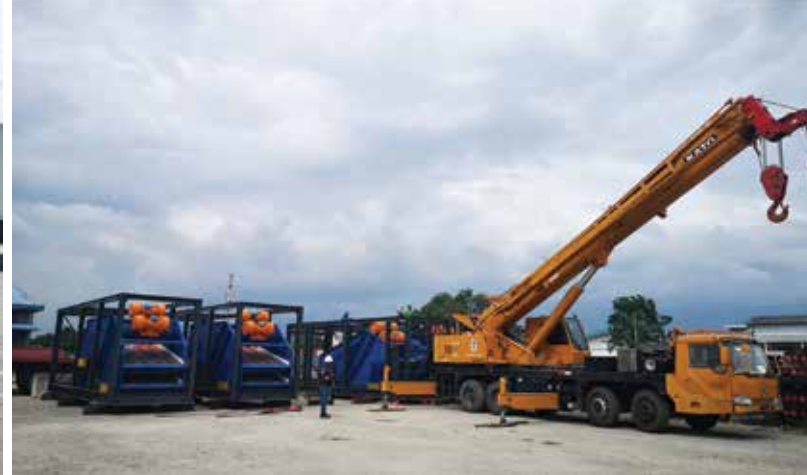
Germany - air freighted to Malaysia due to urgency of project