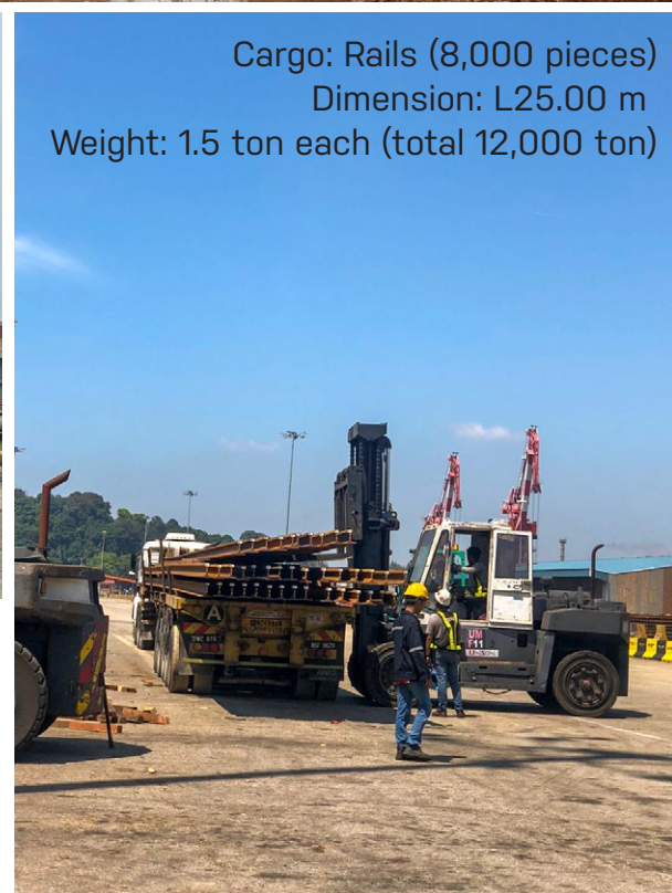
Cargo: Rails (8,000 pieces) Dimension: L25.00 m Weight: 1.5 ton each (total 12,000 ton)