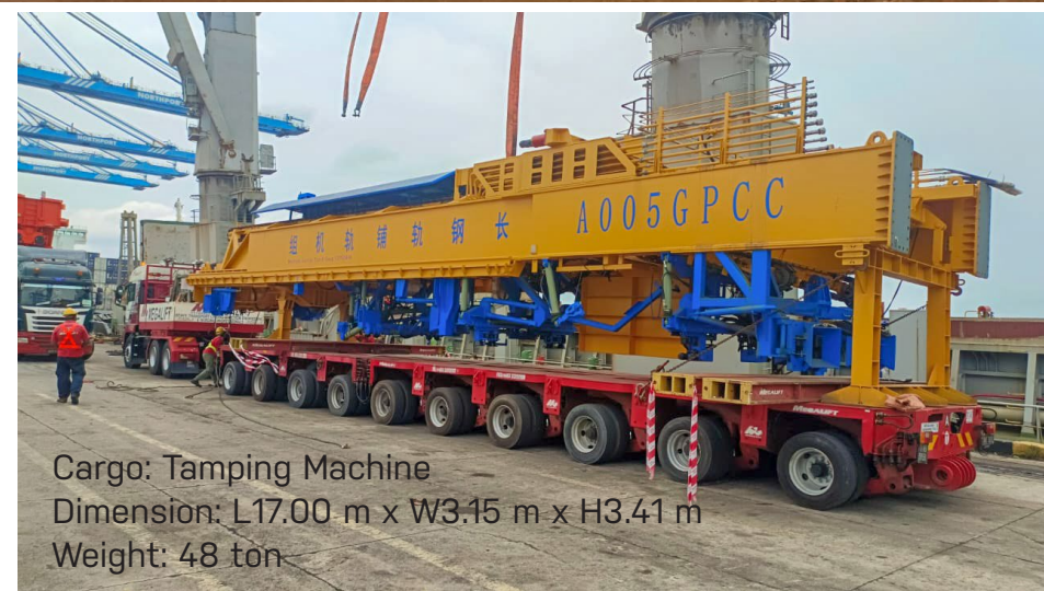
Cargo: Tamping Machine Dimension: L17.00 m x W3.15 m x H3.41 m Weight: 48 ton