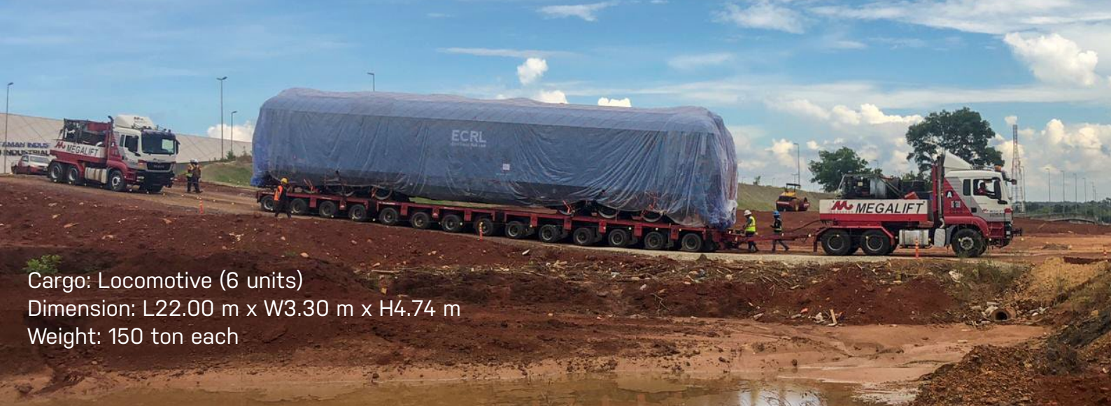
Cargo: Locomotive (6 units) Dimension: L22.00 m x W3.30 m x H4.74 m Weight: 150 ton each