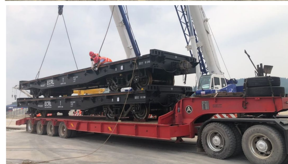
Cargo: Wagons (95 units) Dimension: L14.10 m x W3.18 m x H1.43 m Weight: 24 ton each

This month our team and equipment are occupied with the handling of shipments for East Coast Rail Link (ECRL) project. We have 6 units of locomotives entering via Kuantan Port and 95 units of wagons that arrived in Port Klang, both via conventional vessels. Our team and equipment have been mobilised to receive the cargoes and deliver them in batches to Kuantan for the installation to take place.