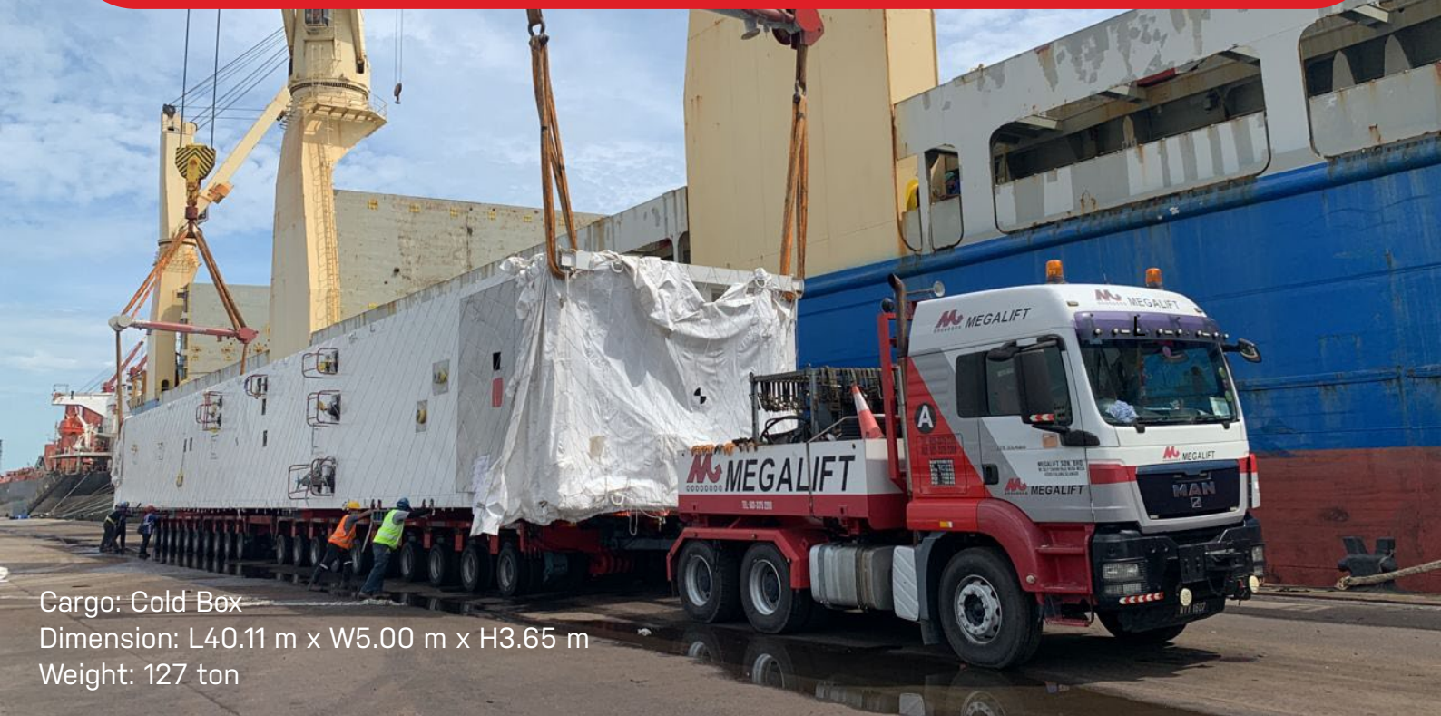
Cargo: Cold Box Dimension: L40.11 m x W5.00 m x H3.65 m Weight: 127 ton

This ASU project is part of the construction of a huge manufacturing plant in Bayan Lepas, Penang. We have been handling several deliveries for the same project since early this year.