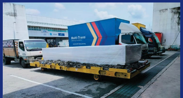
CONVEYOR SPARE PARTS FROM CHICAGO TO KUALA LUMPUR