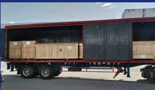
20 TON OF GAS TURBINE COMPONENTS FROM AMSTERDAM TO KUALA LUMPUR

Our client decided to air freight the initially planned sea shipment as the cargoes are urgently in need. The items are a major component of solar power generation which will be required for the scheduled commissioning of the plant.