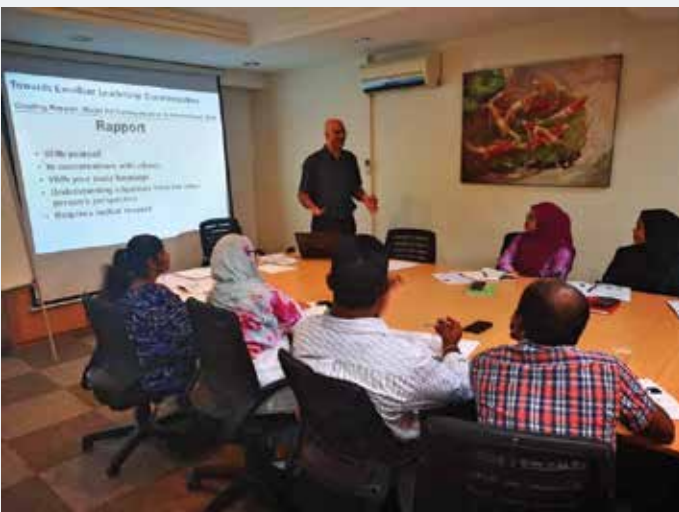
Towards Excellent Leadership Communication training for potential leaders

We believe both technical knowledge and soft skills are crucial for an employee to develop as part of their career advancement prospect.