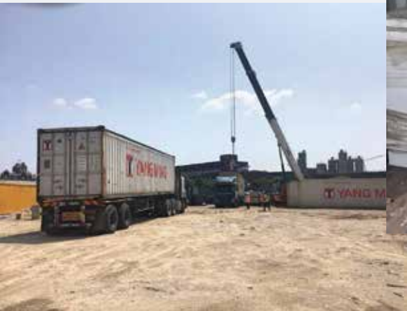
Parts of tunnel boring machine (TBM) being delivered to the specific underground stations