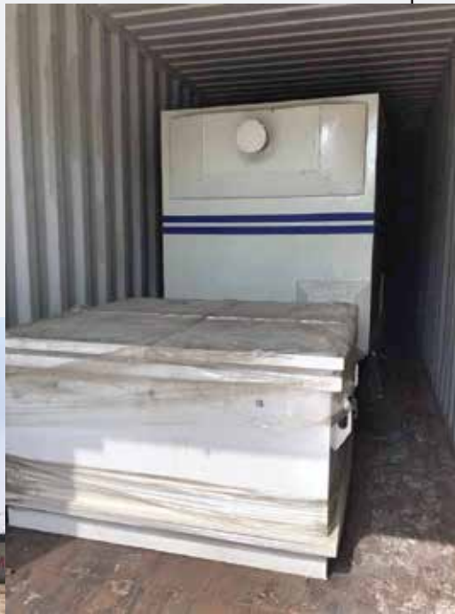
Locomotive equipment imported in open top and high cube containers then delivered to several different sites