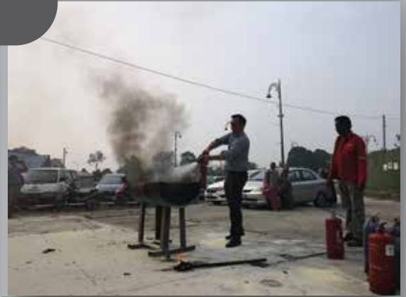
Fire Extinguisher Training for Office Staff at Megalift HQ, Port Klang conducted by Safety Manager